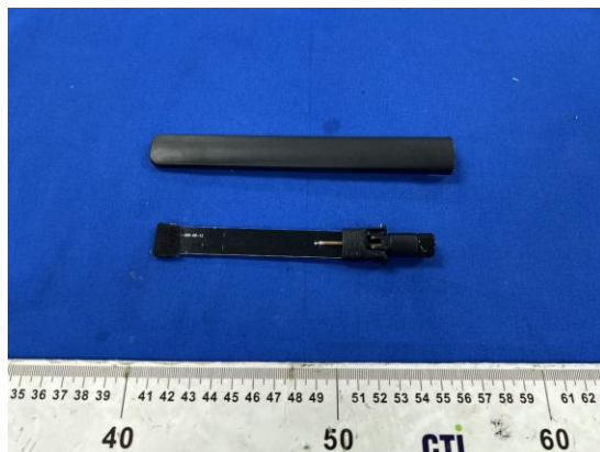
A2240062506101001 Survey position2

Remark: The testing data and result(s) in this report is(are) just for scientific research, education, internal quality control and product development etc.