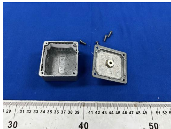
A2240062506101001 Survey position1